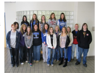
Students that have won Tiger Buck prizes this 2010 school year

If you have not yet won in a Tiger Buck drawing, ask one of your teachers for different ways to earn more Tiger Bucks.