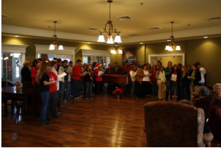
MCHS Beta sings Christmas songs at Stonecrest.