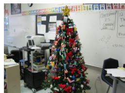
Christmas tree decorated by the students

There are a variety of things they work on during the day, but most the students have different things that they