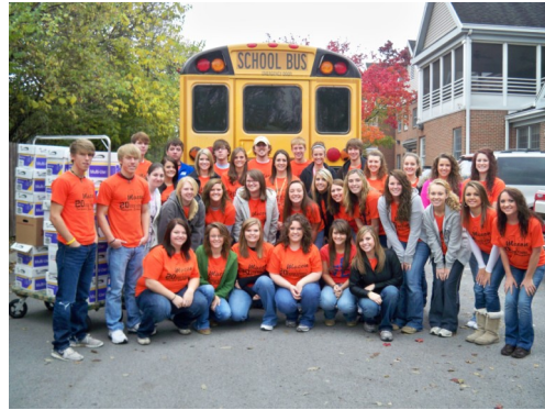
Service Learning visits Ronald McDonald House with the 900 lbs of collected can tabs

looks forward to another successful semester beginning in January.