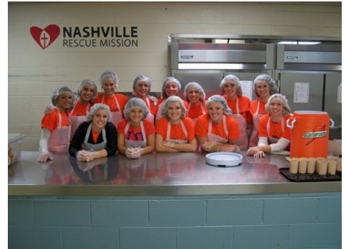
Service Learning serves food at Nashville Rescue Mission

looks forward to another successful semester beginning in January.